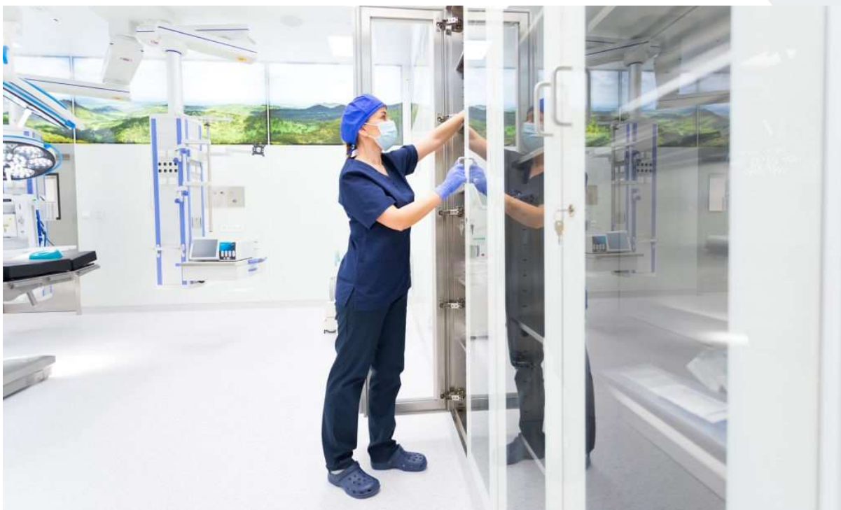
Figure 2: One of the 5 operating theatres and preoperative washing area.