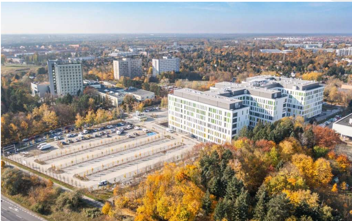
Figure 1: Children's Health Centre of Wielkopolska.